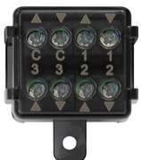
03997 - Quid rolling shutters module