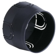
V71001.AU - Flush mounting box ø 60mm light black