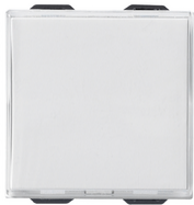
09050 - 1P NO 10A name-plate push button white