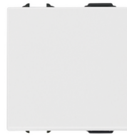
09005.2 - 1P 16AX 2-way switch 2M white