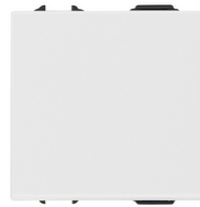
09001.2 - 1P 16AX 1-way switch 2M white