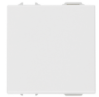
09013.2 - 1P 16AX reversing switch 2M white