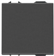
09008.2.CM - 1P NO 10A 2M push button carbon matt