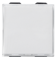
09050 - 1P NO 10A name- plate push button white