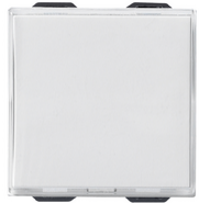
09050 - 1P NO 10A name-plate push button white