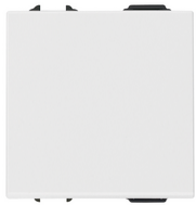
09008.2 - 1P NO 10A push button 2M white