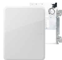
03816 - By-alarm Plus 24M switch box adaptor