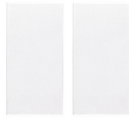
20506.B - Button 1M for RF switch white - 2pieces