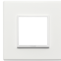
21642.17 - Plate 2M aluminium total white