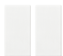
14506 - Button 1M for RF switch white - 2pieces