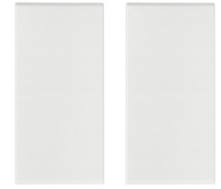
19506.B - Button 1M for RF switch white - 2pieces