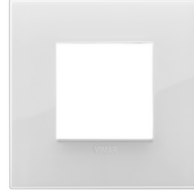
19642.B66 - Classic plate 2M Reflex ice TL