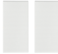
19506.B - Button 1M for RF switch white - 2pieces