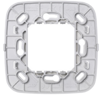
19507.RN.B - Frame RF device Round plate white