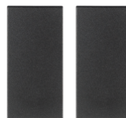
19506 - Button 1M for RF switch grey - 2pieces