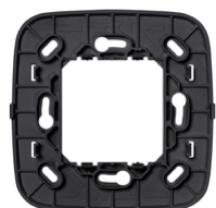
19507.RN - Frame RF device Round plate grey