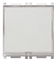
14050 - 1P NO 10A 250V name-plate button white