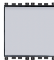
19050 - 1P NO 10A name- plate push button grey