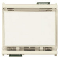
08420 - 1P NO 10A 12-24V name-plate push button