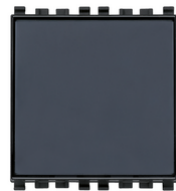
20050 - 1P NO 10A name- plate push button grey