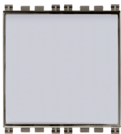
19050.M - 1P NO 10A name- plate push button Metal