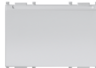
14465.SL - Vertical pocket badge switch Silver