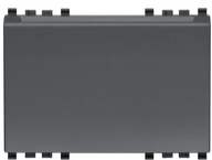
20465 - Vertical badge switch grey