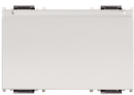
16465.B - Vertical badge switch white