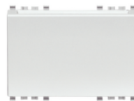
20465.N - Vertical badge switch Next