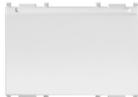
14465 - Vertical pocket badge switch white