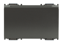
16465 - Vertical badge switch grey