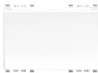
20465.B - Vertical badge switch white