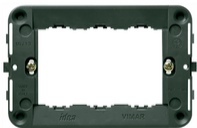
16713 - Frame 3M +screws