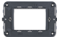
16723 - Frame 3M Arké idea+screws grey