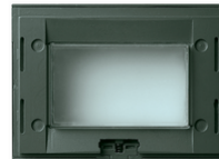
16813.Q - IP55 frame 3M grey