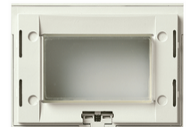
16813.Q.B - IP55 frame 3M white