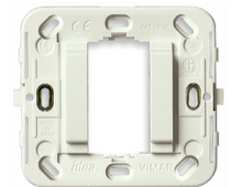
17086.B - Frame 1M smooth no/screws ø60/56x56mm w