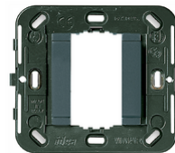
17086 - Frame 1M smooth no/screws ø60/56x56mm g