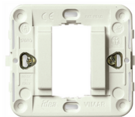
17080.B - Frame 1M smooth front+claws white