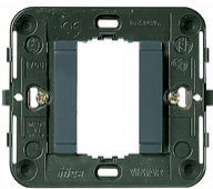
17080 - Frame 1M smooth front+claws grey