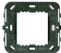
17087 - Frame 2red.M no/screws ø60/56x56mm