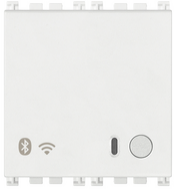
19597.B - IoT connected gateway 2M white