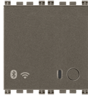
19597.M - IoT connected gateway 2M Metal