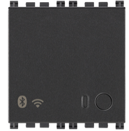
19597 - IoT connected gateway 2M grey