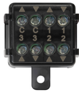
03997 - Quid rolling shutters module