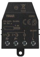
03992 - Quid - Step relay module 10A+reset