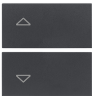
20752.2 - 2 half buttons 2M arrows symbol grey