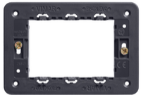
21613 - Frame 3M +screws