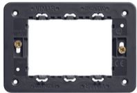
21613 - Frame 3M +screws