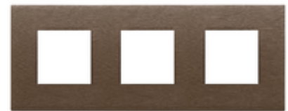
Plate 6M(2+2+2)x71mm metal dark bronze

Wiring devices / Traditional wiring devices / EIKON / Cover plates