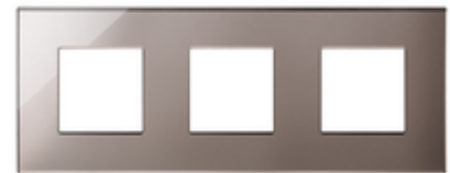
Plate 6M (2+2+2) 71mm glass shiny bronze

Wiring devices / Traditional wiring devices / EIKON / Cover plates