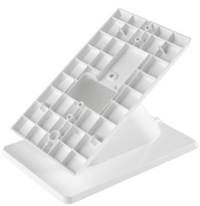
40598 - Voxie desktop white