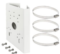
46917.002.01 - Pole bracket for IP Bullet/SpeedDome