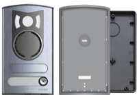
13K1 - 1-button a/v aluminium cover plate