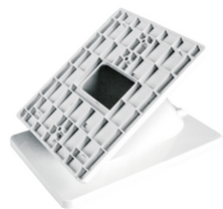
753A - Table box for Tab white