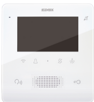
7559 - Video entryphone Tab Free 4.3 2F+ white