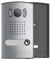
40151 - Audio/Video color entrance panel 1Fam.