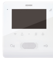
7559 - Video entryphone Tab Free 4.3 2F+ white