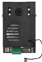
40135 - Audio/Video unit 2F+