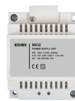
M832 - Safety transformer 230V 12Vac 35W