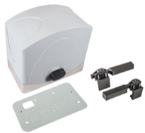
ESM2 - ACTO 600D sliding operator 24V 600kg