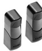
EFA1 - Pair of 12/24V 110mA 180° photocells 15m