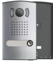
40151 - Audio/Video color entrance panel 1Fam.