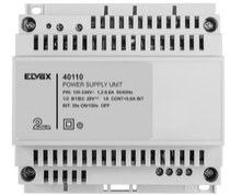
40110 - Supply unit 2F+ 100-240V 1 OUT 1,6A