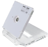
40595 - Tab 5 Up desktop