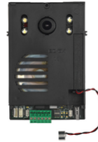
40135 - Audio/Video unit 2F+