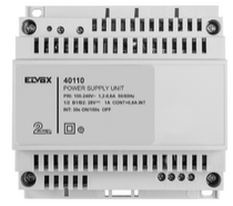
40110 - Supply unit 2F+ 100-240V 1 OUT 1,6A