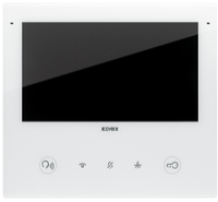
40517 - Tab7S Up video entryphone 2F+ Wi-Fi whit