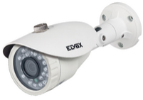
46CAM.136B.8 - Bullet IR AHD cam1080p 3,6mm lens CVBS