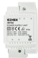
40102 - Entryphone supply unit SS120/230V~ 50/60