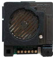
930G - Sound System audio unit for 4+n