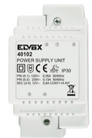
40102 - Entryphone supply unit SS120/230V~ 50/60