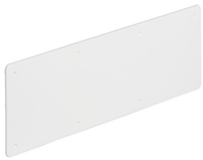
V70109 - High-resistance cover for V70009