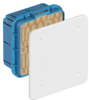
V70001 - Flush junction box 92x92x50mm