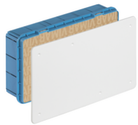
V70007 - Flush junction box 287x154x70mm