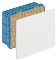
V70006 - Flush junction box 195x154x70mm