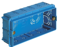
V71305 - Flush mounting box 5M light blue