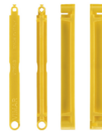
V71563 - Joint plate for flush-mount boxes yellow