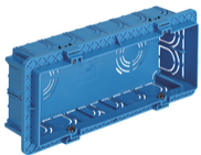
V71306 - Flush mounting box 6-7M light blue