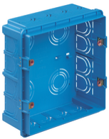
V71318 - Flush mounting box 8M light blue